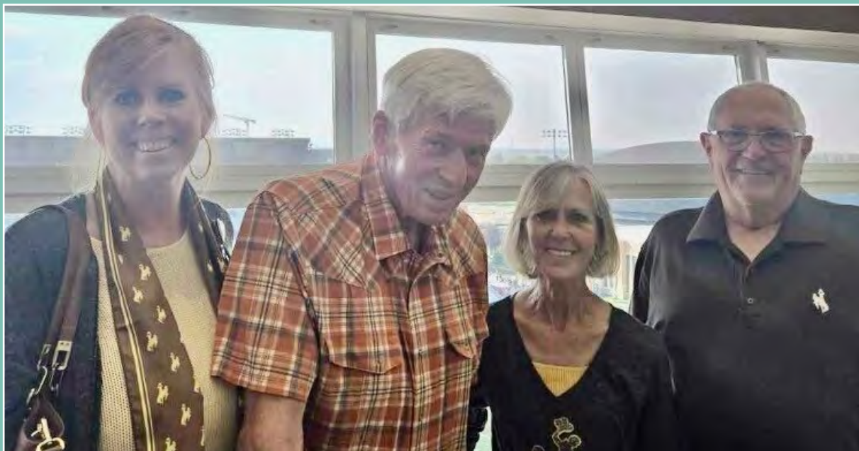
Photo taken in the UW Wildcatter Suites. Special thank-you to FNBO for providing the IMH Foundation with tickets for the UW Cowboys Football game.